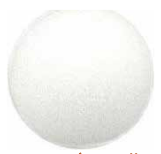
6" Styrofoam Ball